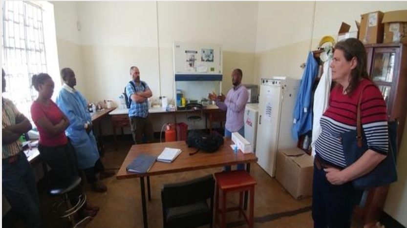
Discussing logistics and options for microbiology at the NADDEC laboratory Entebbe