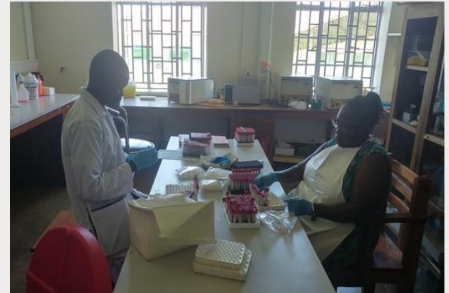
GeneXpert machines for tuberculosis diagnosis at the Mbarara University Hospital laboratory.