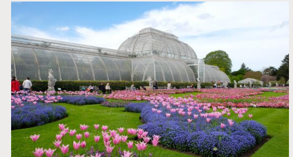
Kew Gardens in the spring

Fun fact about yourself? As well as working at LSHTM, I am a practicing artist and regularly exhibit my artwork.