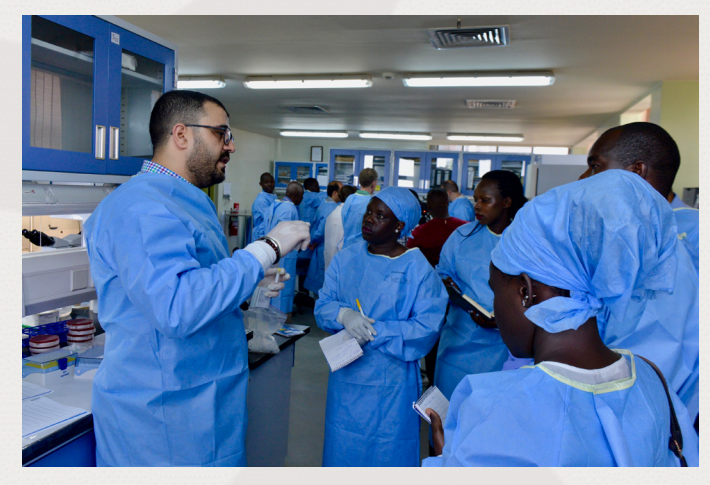
Staff in Uganda are trained on how to process and test samples in a MALDI TOF